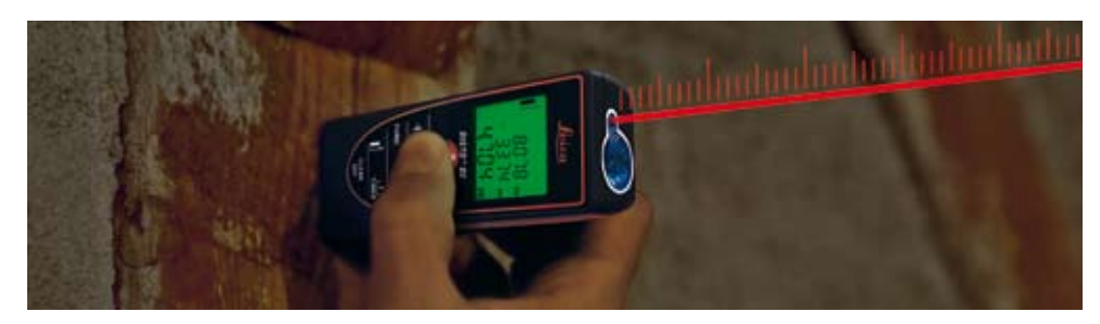
The illuminated display makes your measurement results clearly readable, even in the dark.