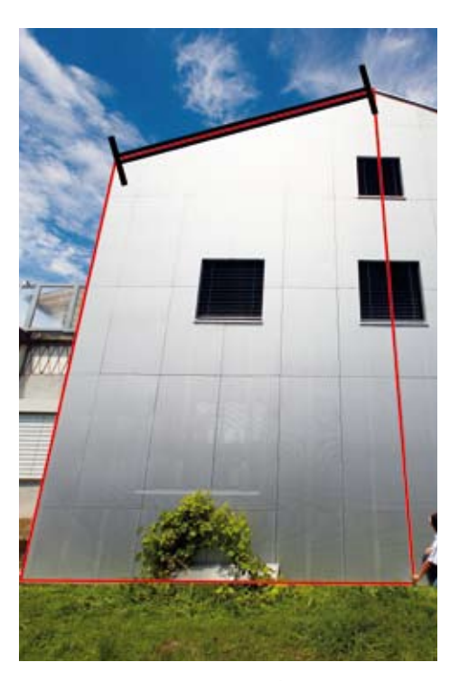
The trapezium function provides you with a simple way of measuring roof slopes.