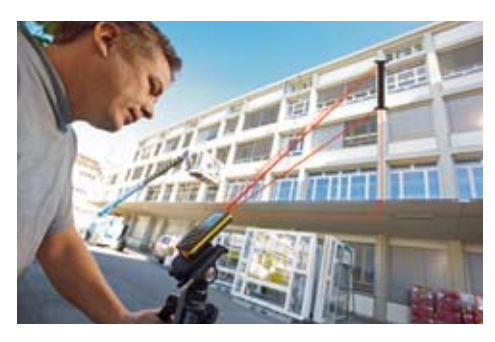
Indirect height-measurement: Window heights can be determined using the Pythagoras function.