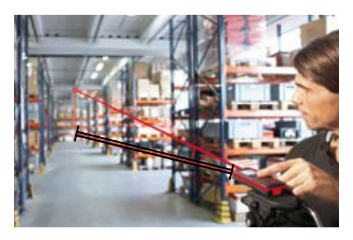
Smart Horizontal Mode ^{\text{TM}} – measure distances absolutely horizontally, even past obstructions.