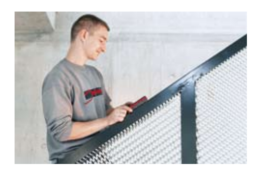
Measure tilts up to \pm\,45^\circ quickly and simply