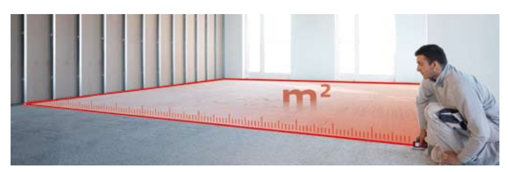
The Leica DISTO™ DXT has a diverse range of functions, e.g. addition, subtraction, area, volume, Pythagoras, continuous measurement, min/max measurement.