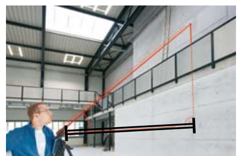
Indirect height measurements using Pythagoras functions.