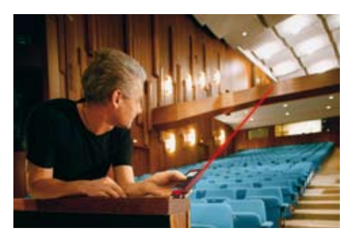
Professional dimensions can be taken even to inaccessible places.