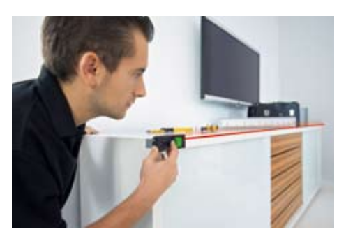
Measuring from edges or corners – with the flip-out end-piece you are equipped for any measurement situation.