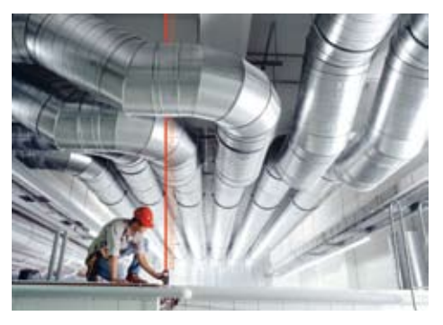
The room height is obtained effortlessly at the press of a key.