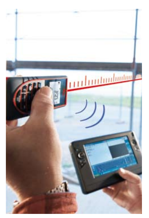
Measure distances in just a few seconds and use them immediately in your Pocket PC or PC.