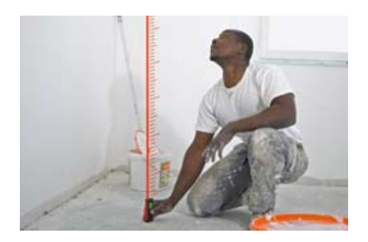
Quick and easy – measure distances and calculate areas or volumes at the touch of a button.