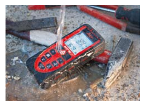
Extremely robust with IP 65 protection.