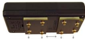
Signals are transmitted into the Concrete

Co-planer electrodes on the base of the Concrete Encounter transmit parallel low frequency signals calibrated to give average moisture content by comparing the change in impedance between damp and acceptably dry concrete.